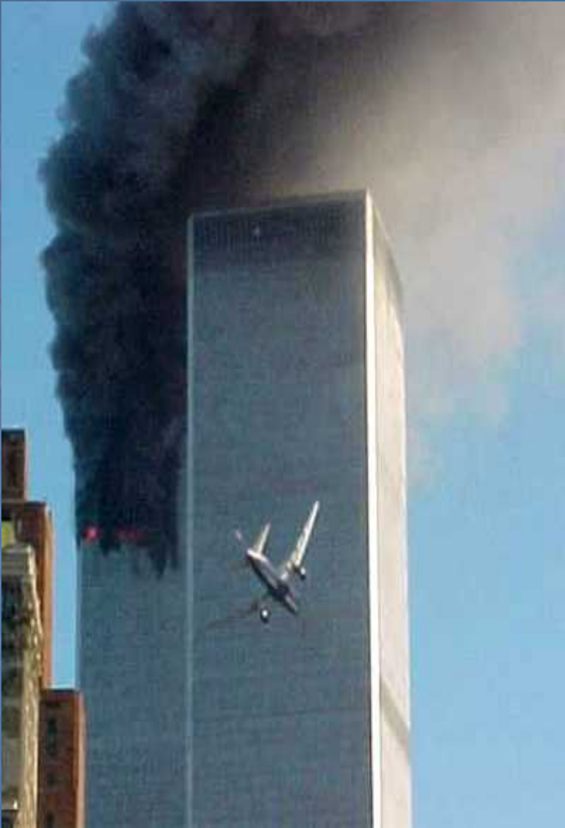
UAL Flight 175 Hitting South Tower