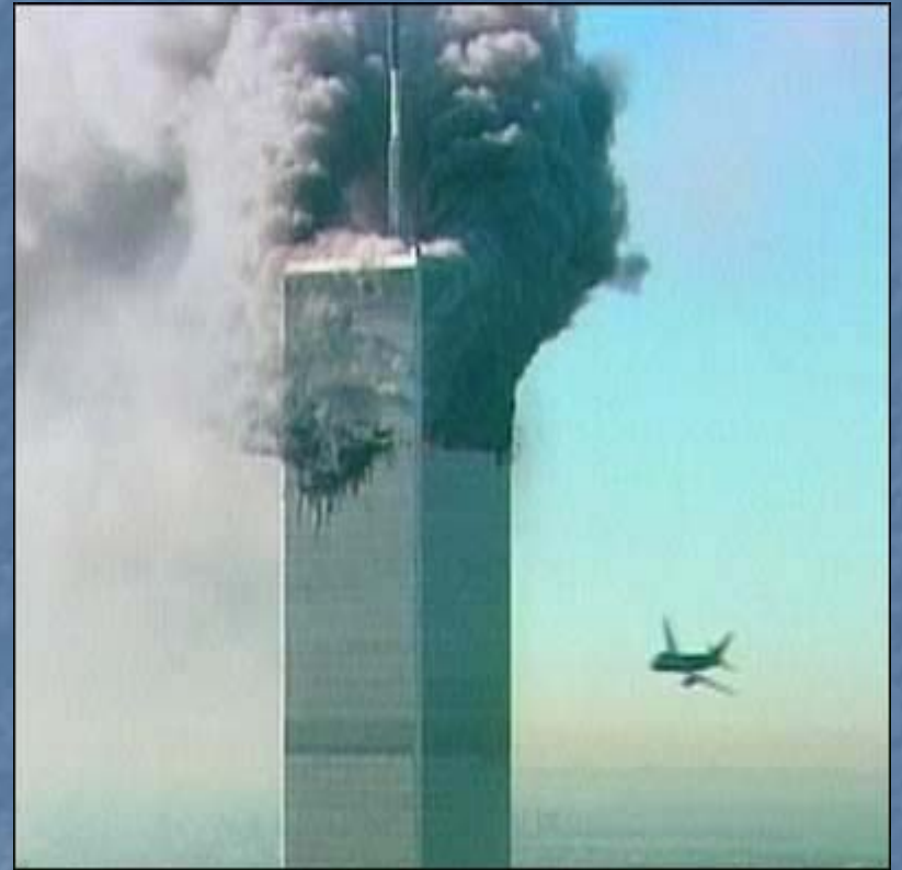
AA Flight 11 Hit the North Tower